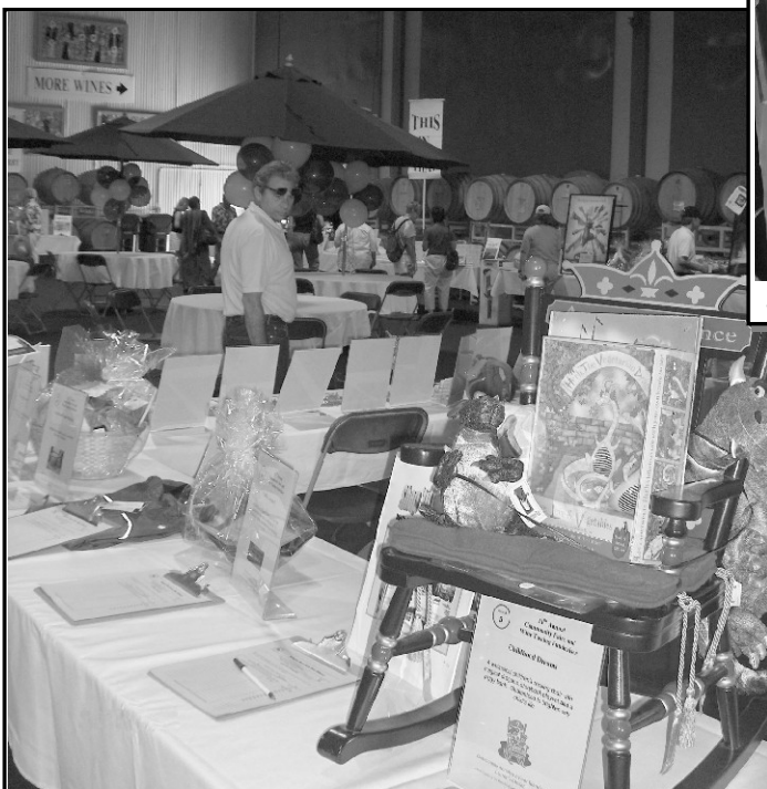
Great variety of silent auction items!