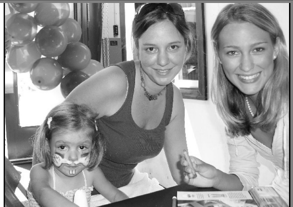
Face painting fun