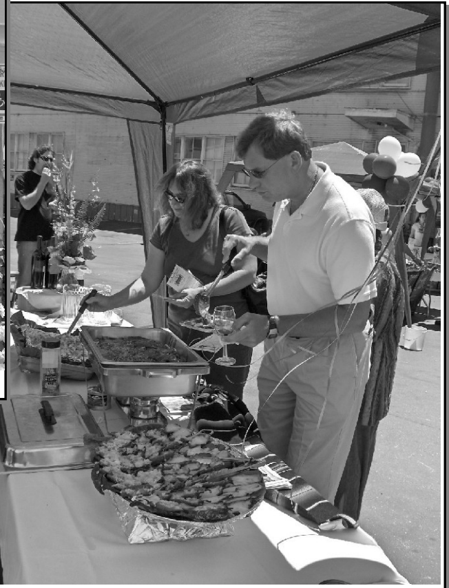
Sampling foods donated by local restaurants